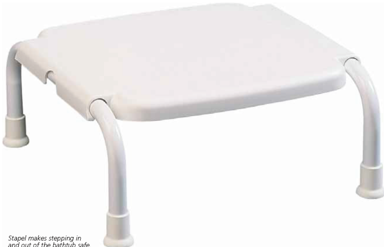
Stapel makes stepping in and out of the bathtub safe.

Stapel is a sturdy and safe stool which can be used in many situations. It is ideal to use when stepping into the bathtub or as a footstool when using the toilet. Stapel has a tubular steel frame and a plastic top that can easily be snapped off for cleaning.