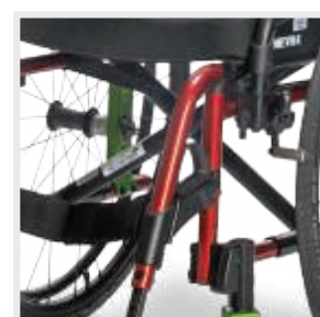
Compact or standard upper leg rest, removable & swing-away