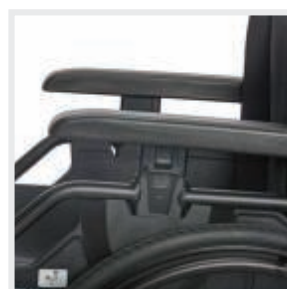
Adjust height-adjustable side guard with one hand

Adjust step-wise or progressively to perfectly fit your needs