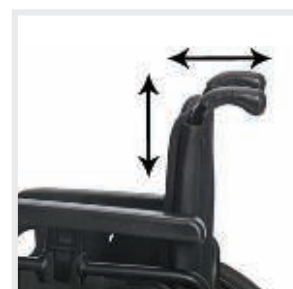
Telescopic and angle- adjustable back