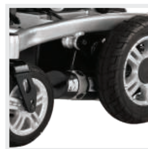
Powerful 2 x 300W or 2 x 350W motors