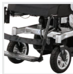
Reinforced and built tough

Safely light your way with long-lasting LEDs