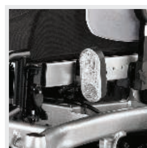
Long-lasting LED lighting system