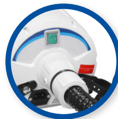
COMPATIBLE PUMP DESIGN*