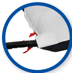
DUAL CONNECTION POINTS